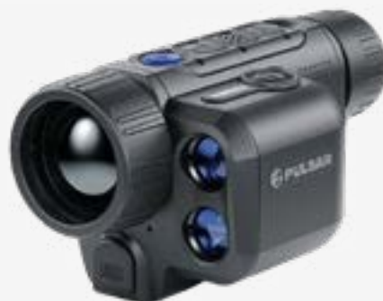
Pulsar Axion 2 LRF XQ35 Pro Thermal Imaging Monocular

Advanced devices: Due to their high specifications, advanced devices produce more accurate detail and higher quality images. This makes them suitable for use as a survey aid for professional and ecological wildlife surveys.