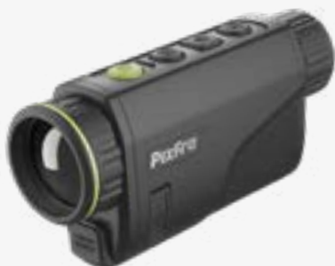
Pixfra Arc 613 Thermal Imaging Monoculars