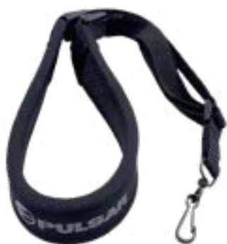
Pulsar Neck Strap