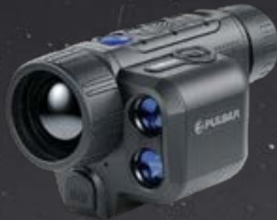
Pulsar Axion 2 LRF XQ35 Pro Thermal Imaging Monocular