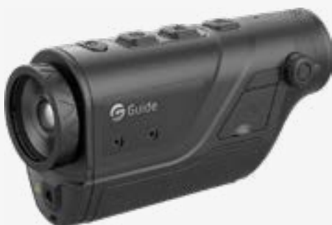
Guide TD210 Thermal Imaging Monocular

Some thermal imaging devices have low specifications and for this reason they are not suitable for professional wildlife surveys. These devices tend to be more affordable and are suitable for general wildlife watching.