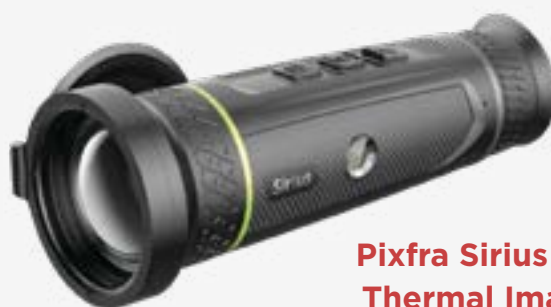
Pixfra Sirius S650 Thermal Imaging Monocular