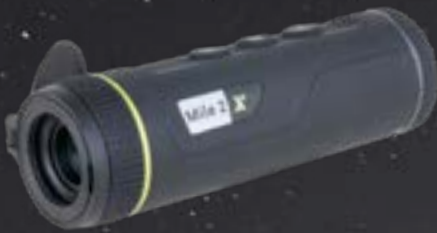
Pixfra Mile 2 M400 Series Thermal Imaging Monoculars