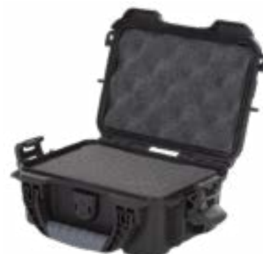
Nanuk Protective Hard Case