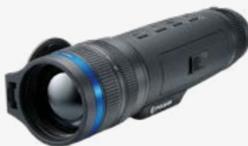
Pulsar Telos XP50 Thermal Imaging Monocular