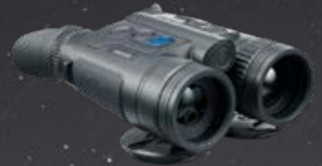
Pulsar Merger LRF XP35 Thermal Imaging Binoculars